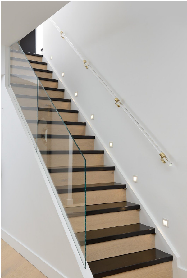
Designed by Iman